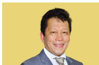
RTN Democrito Diamante